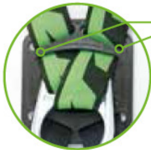
Fall indicators on the back plate for easy inspection